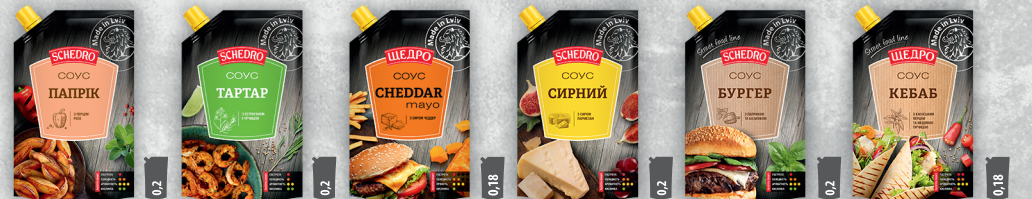
"Paprik" Shelf life: 180 days

TM "Schedro" presents the popular world and local tastes. Sauces contain spices, slices of natural vegetables and other natural ingredients: garlic, onion, pepper, mushrooms, flavoring herbs, pickled cucumber, etc.