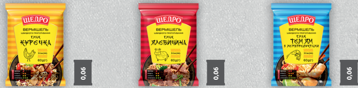
“Chicken” Shelf life: 12 mounts 0,06 “Beef” Shelf life: 12 mounts 0,06 “Tom Yum” Shelf life: 12 mounts 0,06

“Schedro” is excited to introduce a new product category – instant noodles! Our delicious noodles are perfect for quick and easy meals, ready in just 3-5 minutes. Whether you’re at home or on the go, “Schedro” instant noodles are the perfect choice for a tasty and convenient meal.