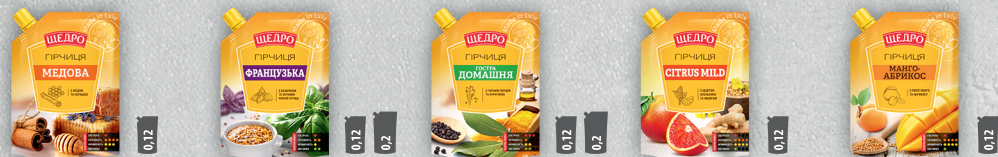
"Honey" Shelf life: 180 days

"Schedro" mustard has an original taste and flavor due to spices that it contains: turmeric, allspice, garlic, cinnamon, cloves, ect. Mustard is rich in proteins, improves digestion and stimulates appetite.