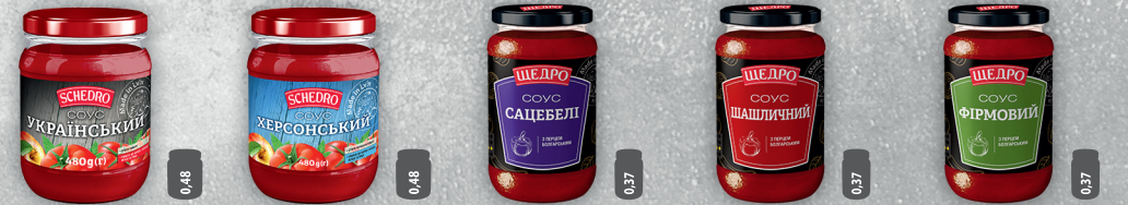
"Ukrainian" Shelf life: 12 mounts