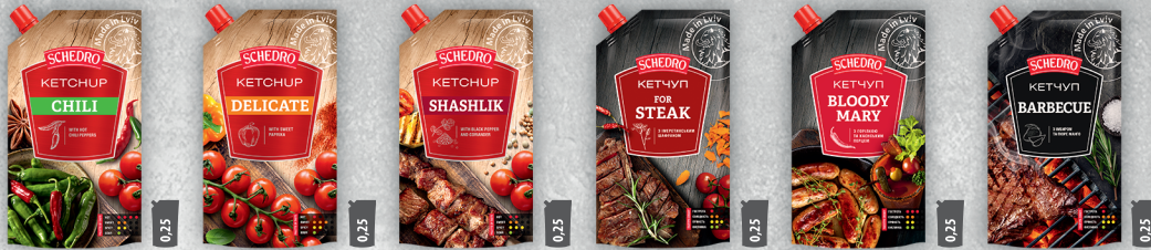
“Chili” Shelf life: 12 mounts 0,25 “Delicate” Shelf life: 12 mounts 0,25 “Shashlik” Shelf life: 12 mounts 0,25 “Steak” Shelf life: 12 mounts 0,25 “Bloody Mary” Shelf life: 12 mounts 0,25 “Barbecue” Shelf life: 12 mounts 0,25

The recipe includes ketchup solid spices that give it rich and full-bodied flavor. Companies technologists developed an individual cocktail of spices for each ketchup.