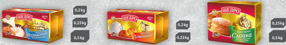
“Creamy special” Fat 72% Shelf life: 180 days 0,2 kg, 0,25 kg, 0,5 kg “Homemade special” Fat 40% Shelf life: 180 days 0,2 kg, 0,25 kg “For puff pastry at home” Fat 80% Shelf life: 180 days 0,25 kg, 0,5 kg

Margarine TM “Schedro” is made of high-quality vegetable oil. It is a unique recipe of margarine that makes your pastry extremely fluffy and fresh.